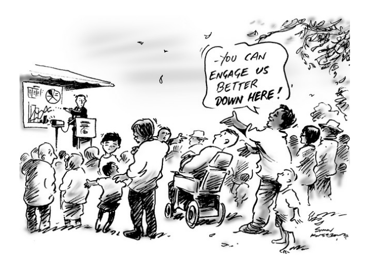
Figure 5: The importance of undertaking genuine participation.