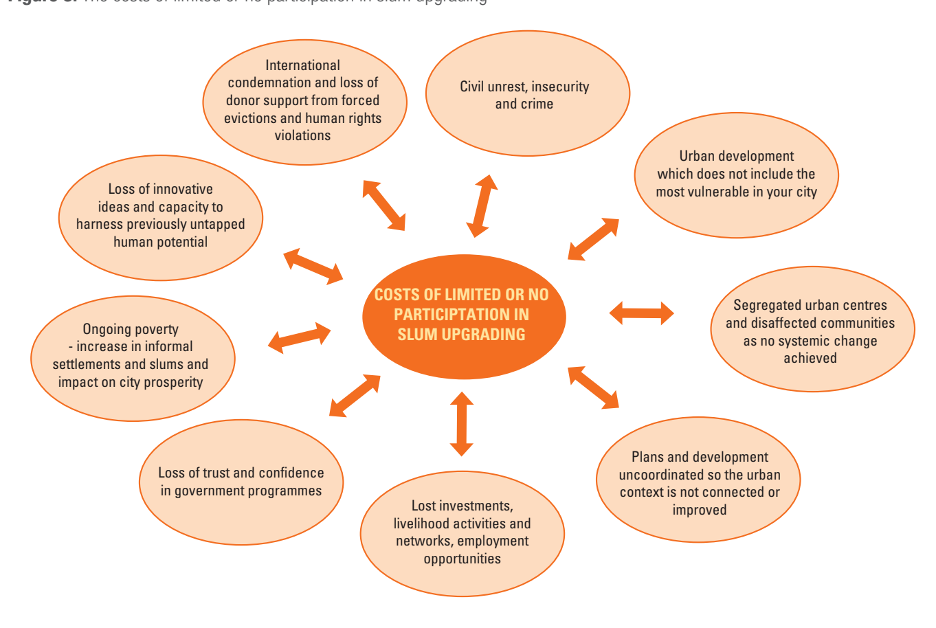
Figure 3: The costs of limited or no participation in slum upgrading