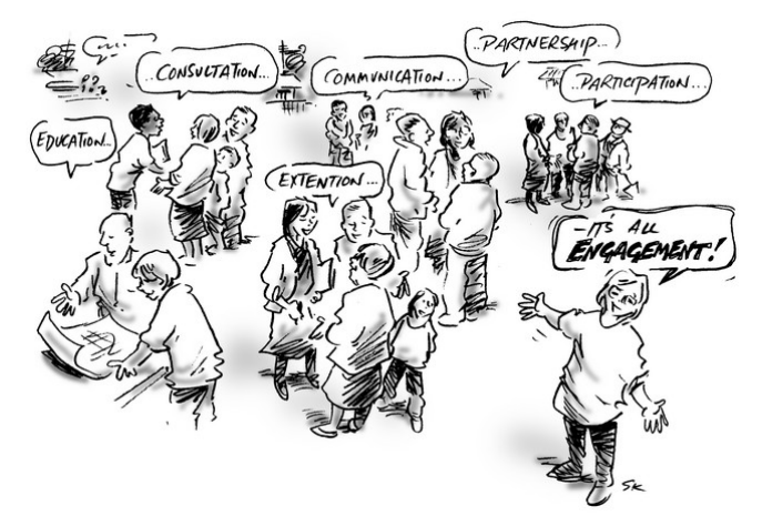
Figure 4: Types of participation.

Source: http://www.dse.vic.gov.au/effective-engagement/introduction-to-engagement/what-is-community-engagement