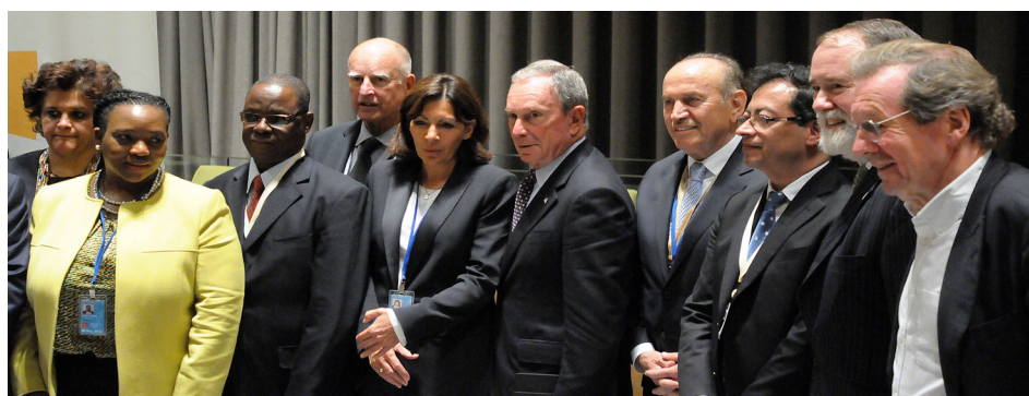
Group shot from the Cities Action Announcements session.

Parties launched the Resilient Cities Acceleration Initiative campaign to double the number of cities and partners in support of city resilience building; to assist five hundred local governments to develop resilience action plans; and to catalyze US$2 billion of