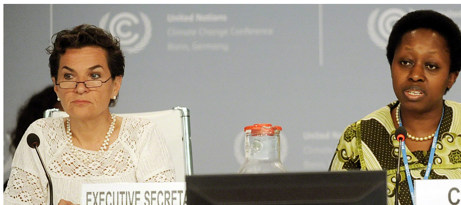
Flanked by the Executive Secretary of UNFCCC, Christina Figueres, the UN-Habitat DED Dr. Aisa Kirabo Kacyira (right) chairs the City Forum.

The Forum reflected the growing realization that cities and other subnational entities play an important role in addressing the climate challenge, but are not yet fully integrated into national and international frameworks. Through the Forum, member states were able to discuss and evaluate the possibilities and modalities of how