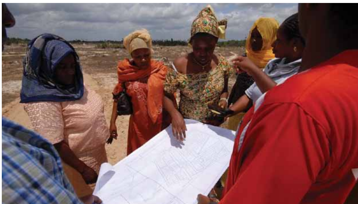
Locals of Chamazi reviewing housing plan, Ghana.

The Gender Equality Programme is intended to deal with gender as a cross-cutting issue in all UN-Habitat projects, programmes and activities; and to support implementation of concrete initiatives on women empowerment. During the reporting period, gender was systematically and effectively integrated into all 36 programmes and projects. The template for developing projects was revised in March 2012 to ensure that gender perspectives are captured in projects and programmes. The Programme Advisory Group and the Regional Programme Review Committees validated programme/project documents to ensure that gender issues are explicitly captured in the projects proposals before approval.