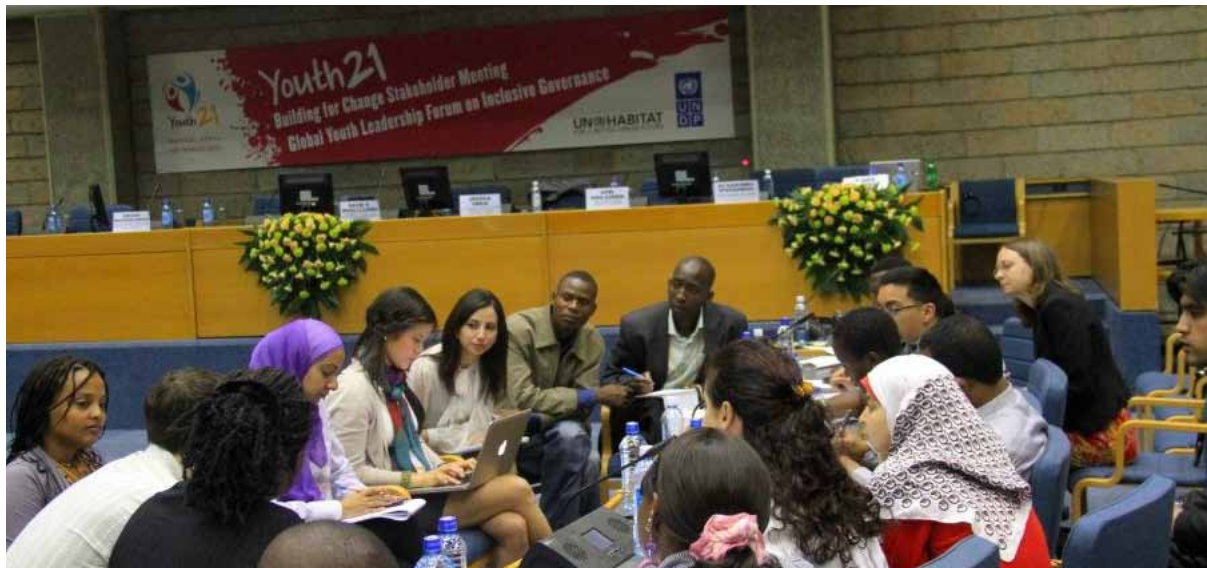
Youth 21 Conference, "Global Youth Leadership Forum on Inclusive Governance", on 18 th March, 2012, Nairobi, Kenya.

The Urban Youth Fund: The fund provides financial support for youth-led development initiatives in developing countries. By June 2012, 172 youth groups globally benefited from the fund. About USD 2.7 million was supporting youth initiatives. In 2012, 59 new organizations were granted about USD 1 million across 43 developing countries.